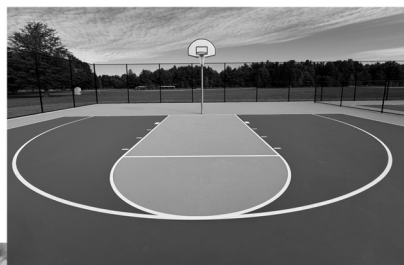
Mullally Park Courts are located at 1850 Horton Rd